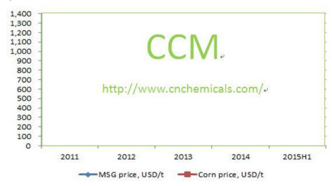
Figure 2.4-1 Prices of MSG and corn in China, 2011-H1 2015